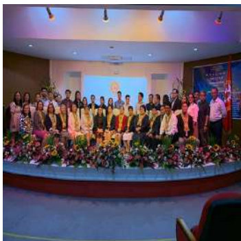
THE Executive Officials with AACUP accreditors