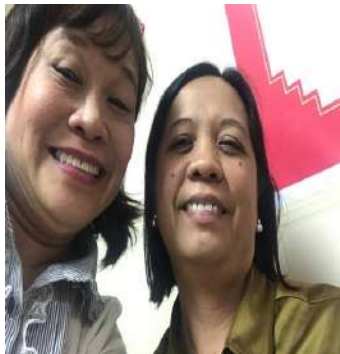
THE LIBRARY ACCRECTOR